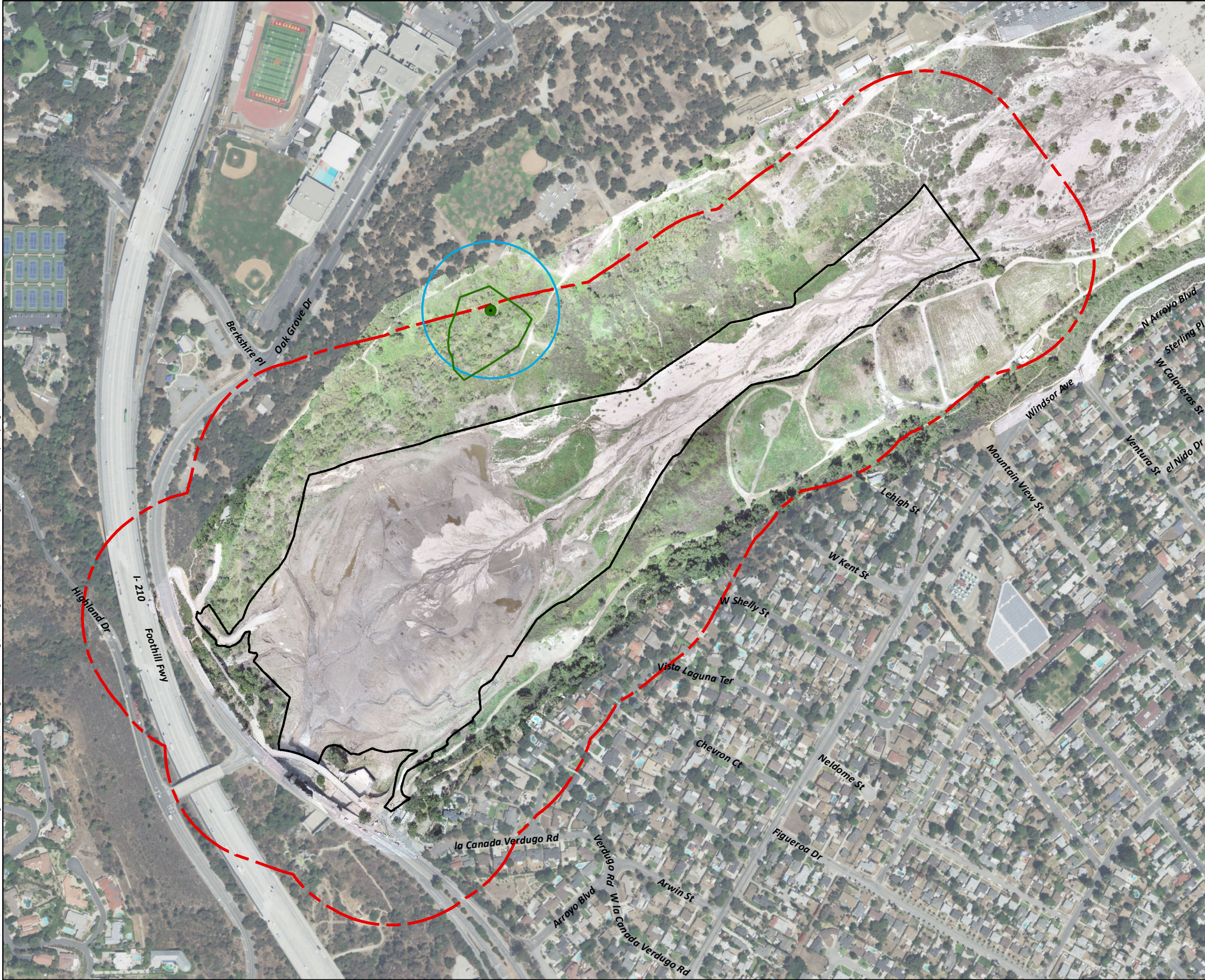
Figure 1. Least Bell's Vireo Nest and Territory Location

Location: N:\2014\2014-003_008 Devils Gate Mitigation Plan\MapStos_and_mitigation_monitoring\2020\DC_LBVI_monitoring_20200528.mxd (MAG)-mguidry 5/28/2020